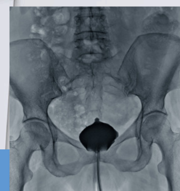
Optimized detective quantum efficiency (DQE) of the dynamic digital flat detector helps improve resolution when imaging urologic anatomy.