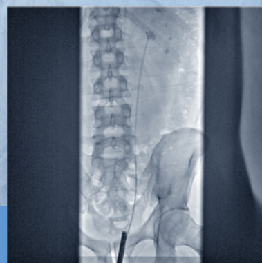
Visualize tiny stones with high image quality and superb grayscale range—even in dense anatomy. See clearly with 2880 x 2880 resolution and 16 bit image processing.